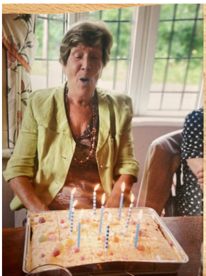
Regular birthday cake

From time to time, members are overcome with the desire to create some craft.