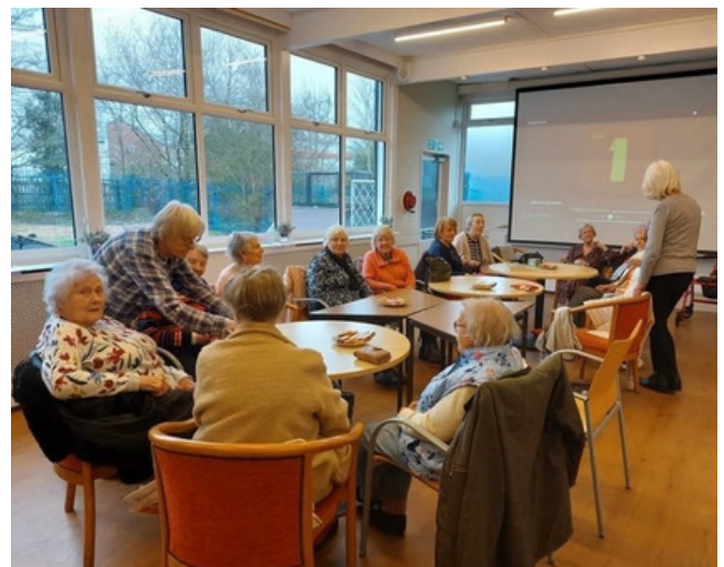
The club's most important role “putting the world to rights”